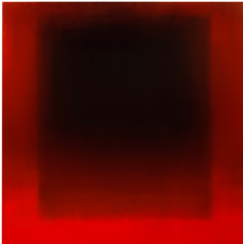
Sergio Lucena, Pintura N° 18, 2011, oil on canvas - 59.1 X 59.1 in