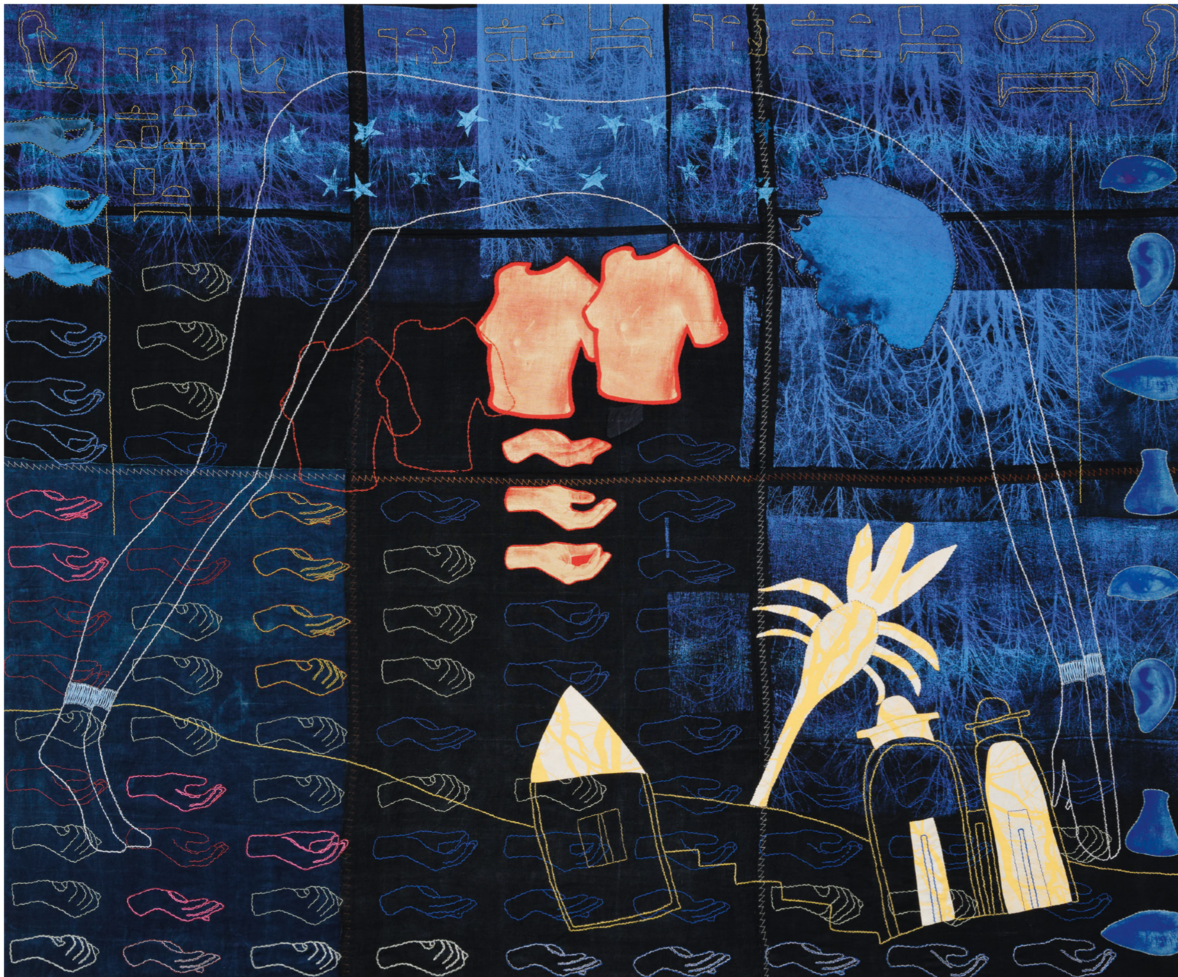
"I have opened the doors of truth. I have passed the waters of heaven. I have raised up a ladder to heaven among the gods. I am one who is with you," 2023. Screenprint on dyed vintage linen with embroidery

as an artist. I've always thought, I'm a fashion designer. I'm going to be big in fashion. I kept going for many years, doing styling, working for fashion brands, doing window installation, working in design, traveling in Europe, living in Copenhagen and Paris. But I always felt like my soul couldn't expand; it couldn't really explore and understand a lot of things. I realized that with fashion, it's so fast, and too beautiful to seek the truth. As an artist, you always want to excavate the truth of something.