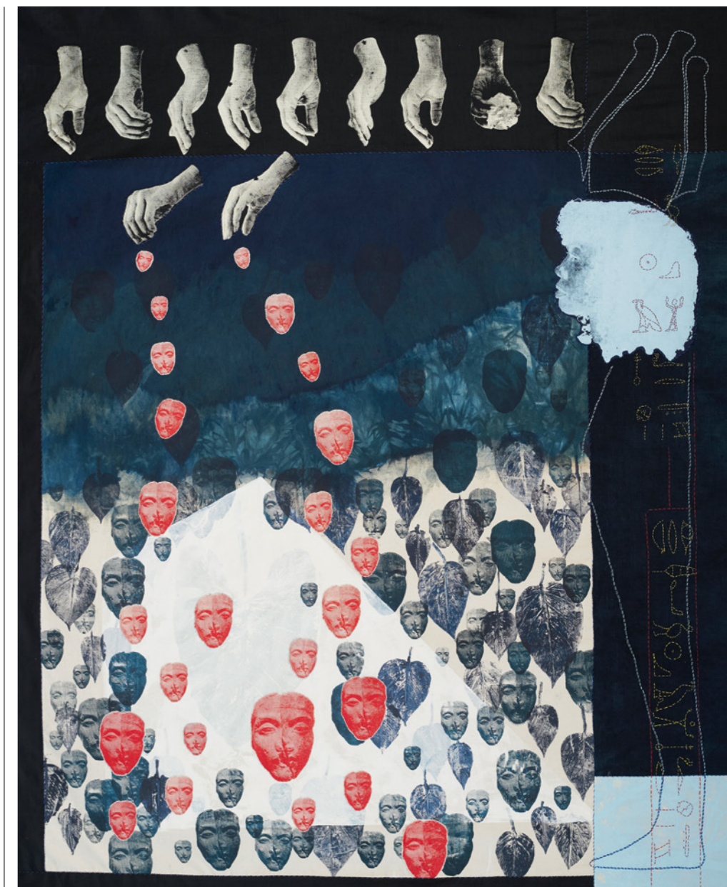
Opposite: "I have arisen from my egg which is in the lands of the secrets . . ." 2020. Screenprint on linen

ZO: I feel like the body is just existing in a particular time of the life span, but our soul, our being, is continuing. What represents that? And, on the other hand, I found it interesting how hieroglyphs have elements of body parts as a sign language. Now, my pieces are becoming more complex, because I print and cut and apply, then I have the embroidery, and then I have all kinds of practical stitching. There are so many different layers that create the narrative.