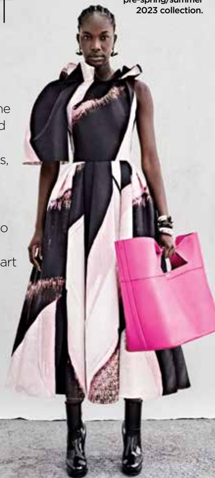
Dress from Alexander McQueen's pre-spring/summer 2023 collection.